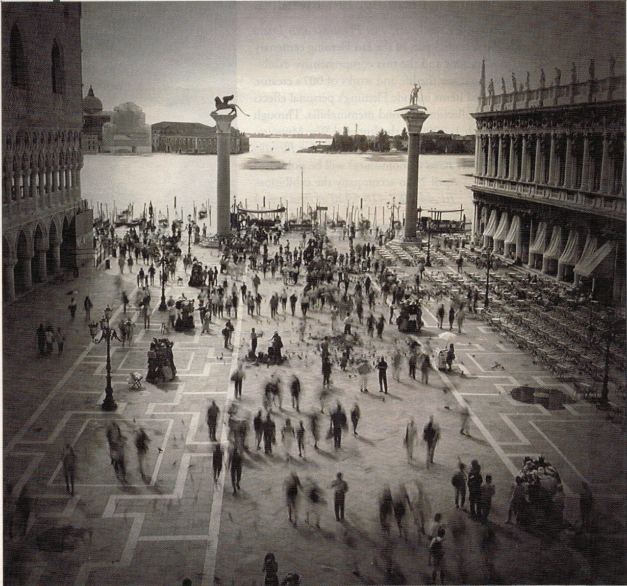
UNTITLED (SAN MARCO) (2001) BY ALEXEY TITARENKO