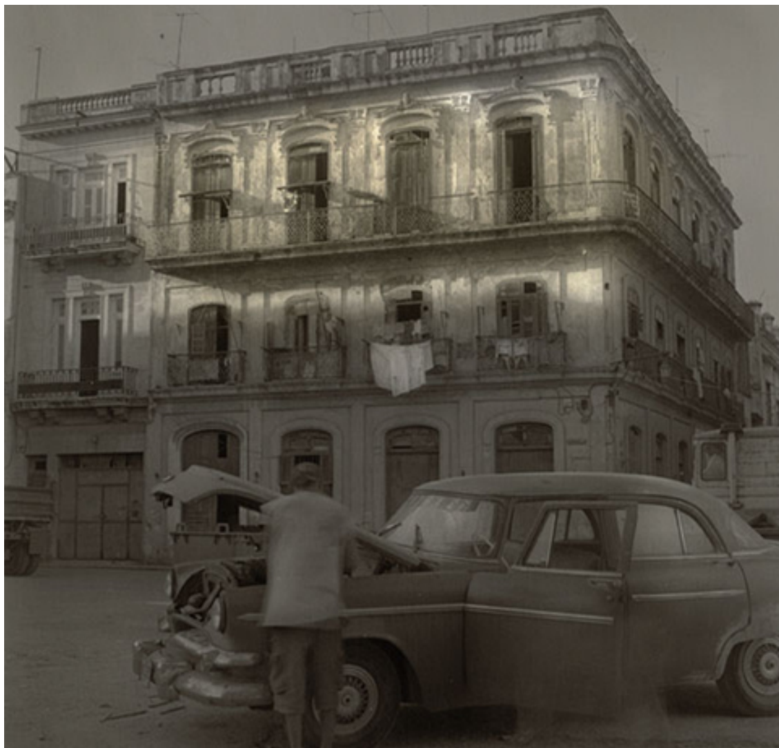
Square/Broken Car, photo by Alexey Titarenko, 2003.

Is Titarenko's study of a woman standing in raking sunlight behind a grate just an image of a woman waiting for someone—or a metaphor of the Cuban condition seen by an artist who had recently shared it?