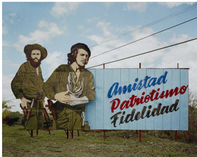
Roadside Billboard in Santa Clara, 2002.