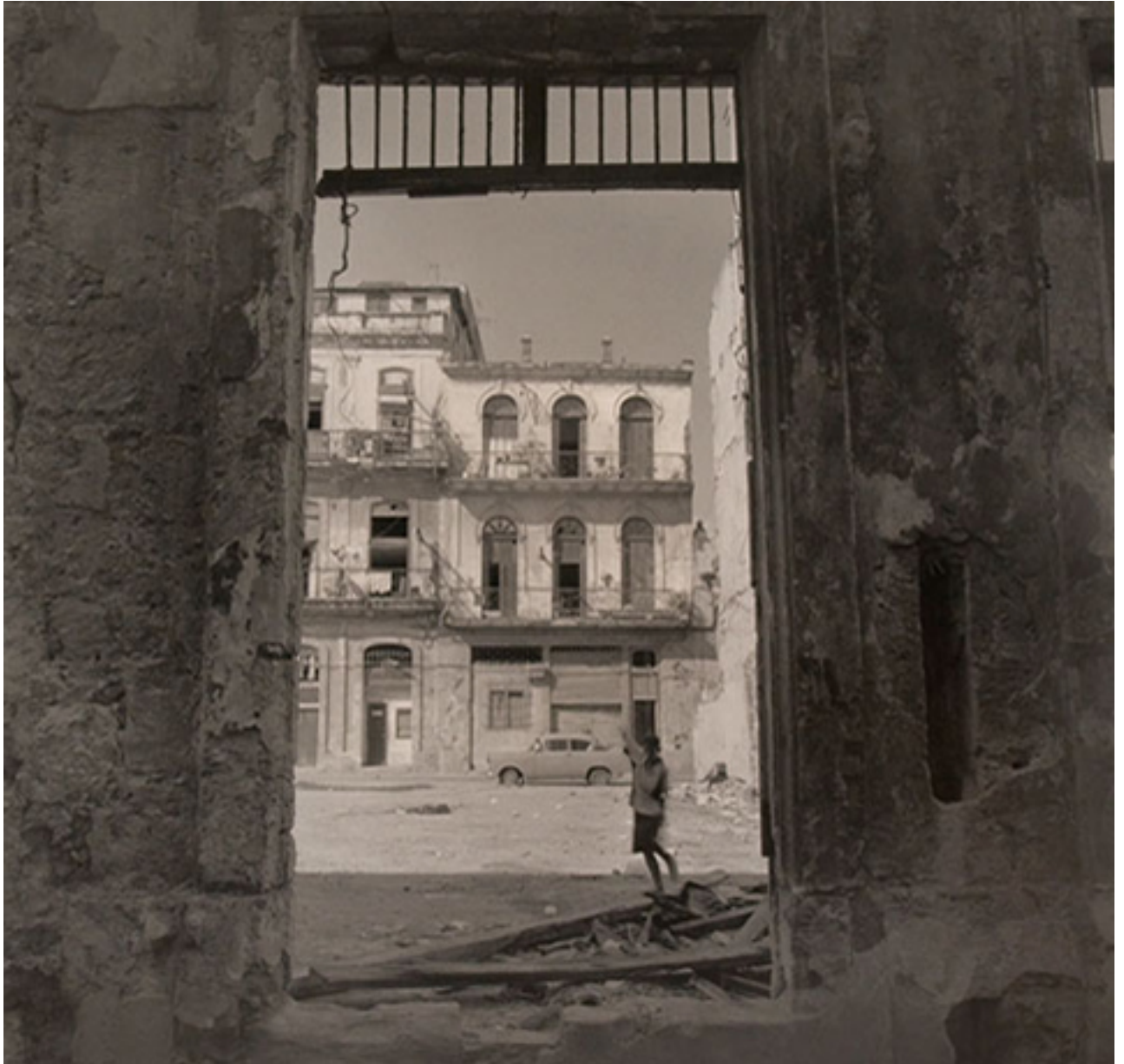
Untitled, photo by Alexey Titarenko, 2003.

When Alexey Titarenko in 2003 made the first of his two trips to Havana, it was a personal photographic journey into the ethos of a city that, like his native St. Petersburg, bore the scars of its revolution in the hearts and minds of its people, but also in the very foundations of its once beautiful architecture.