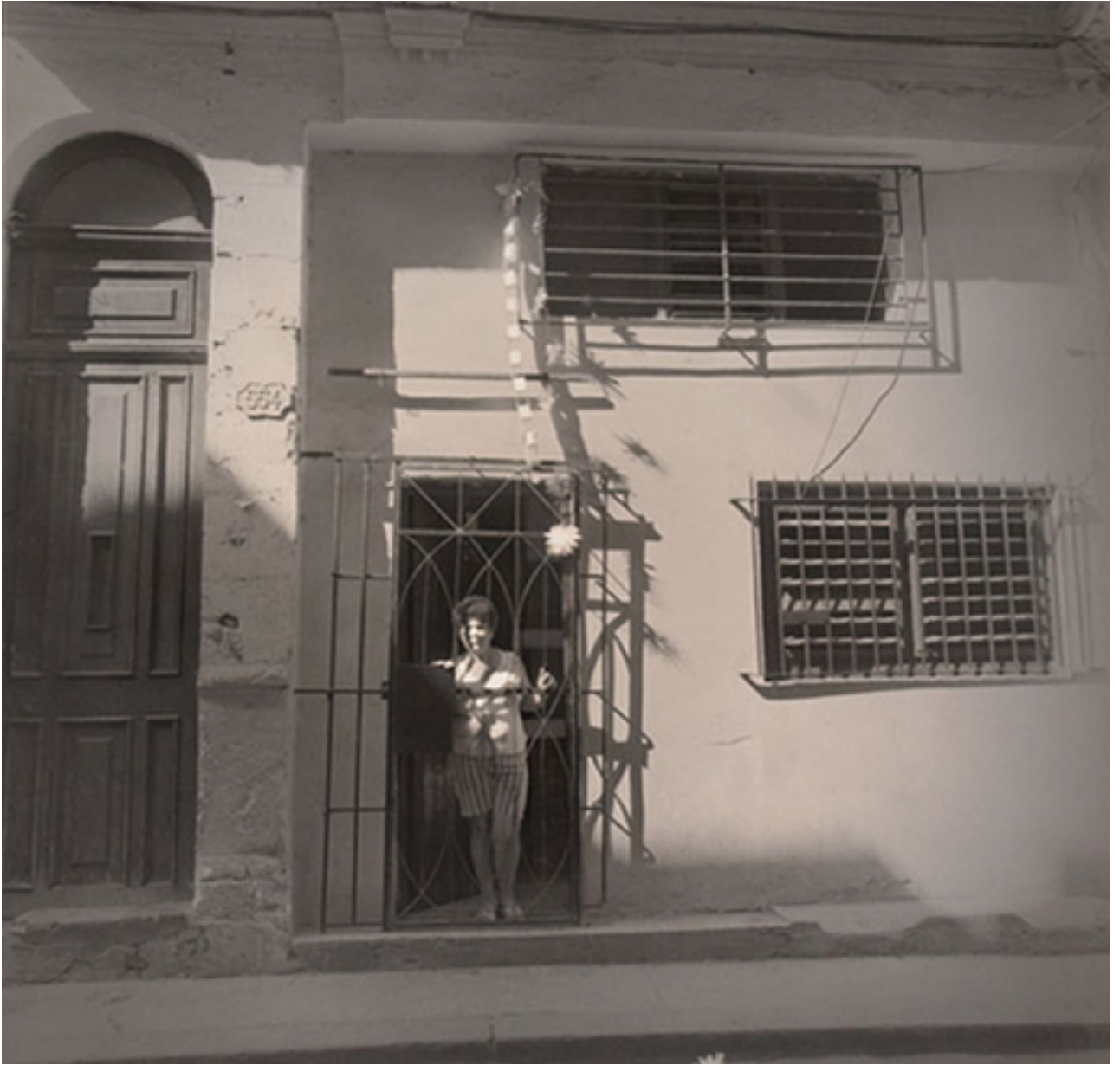
Woman Behind Door, photo by Alexey Titarenko, 2003.

What is clear when you study a group of Evans and Titarenko portraits in the Getty exhibition is the shared concern both artists have, possible political context aside, for compositional and formal, rather than only documentary, values.