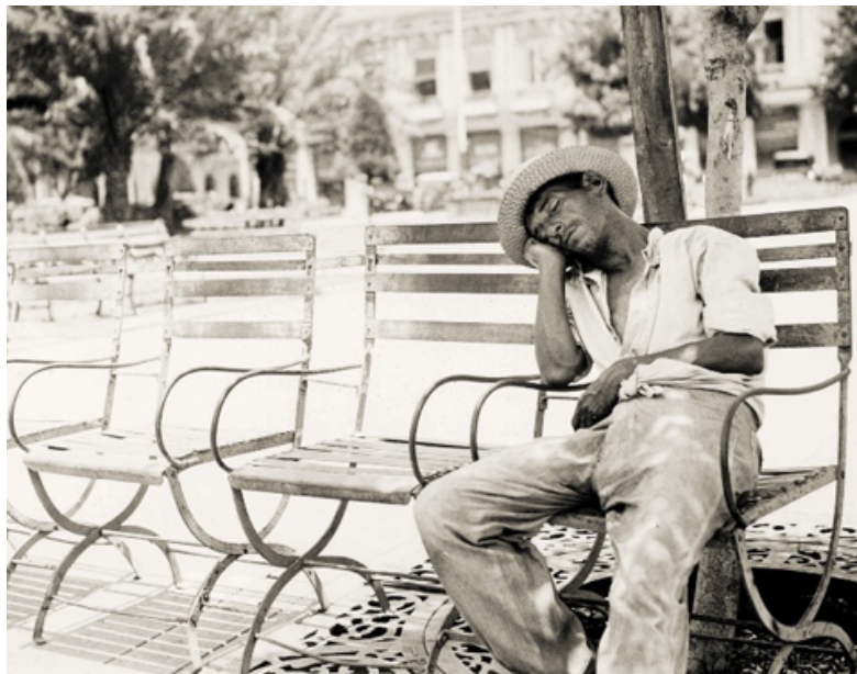
Parque Central II, photo by Walker Evans, 1933. Or the triple portrait of a full figured woman, a gawker and a hastily retreating figure,