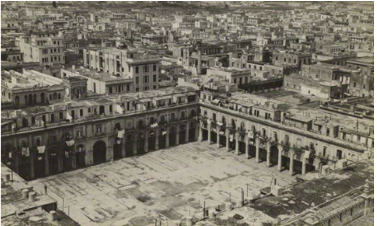
Plaza del Vapor, photo by Walker Evans, 1933.

This riff about buildings being like humans was evocative for me. I thought of the high angle photograph Evans made of a central Havana square that he also detailed in closer eye-level angles. They reveal an impoverished city with already crumbling buildings,