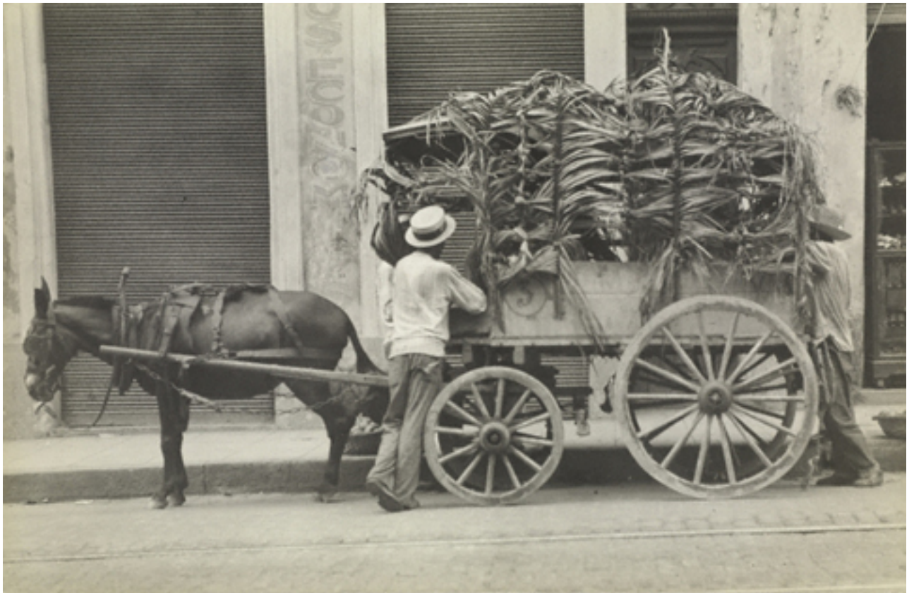
Mule, Wagon, and two Men, photo by Walker Evans, 1933.

Evans' formalist photograph of a horse cart is wondrously static like a sculpture,