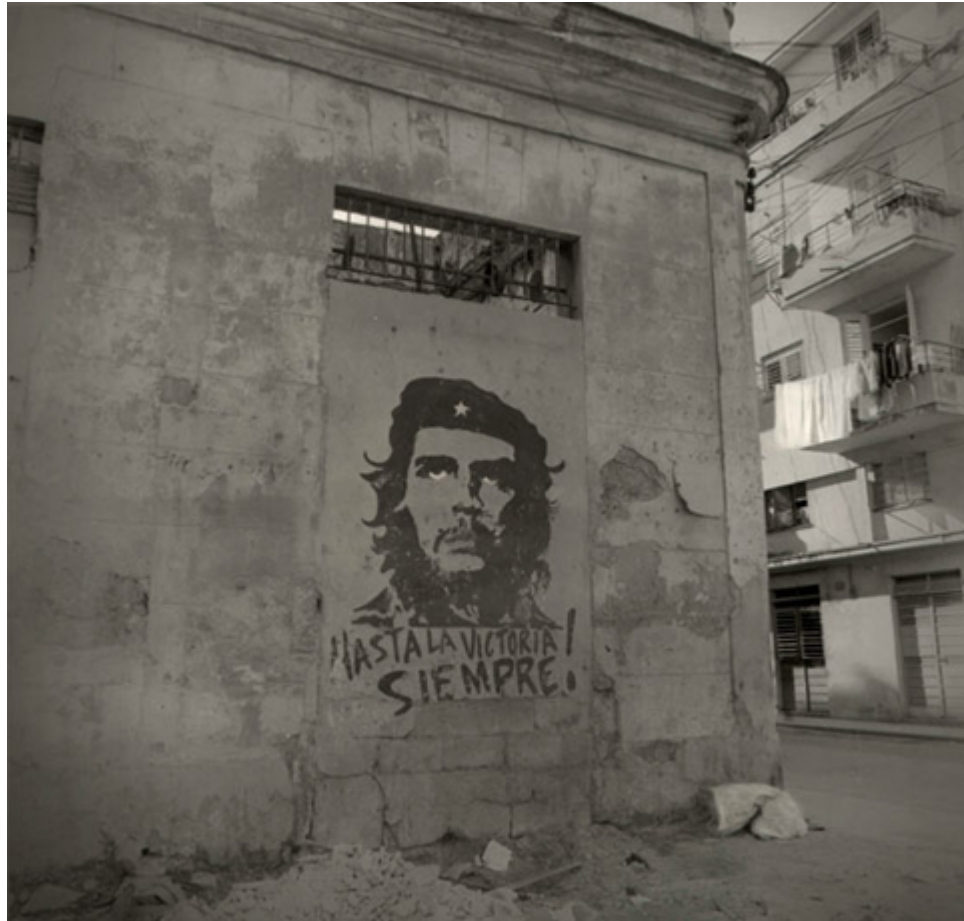
Che, photo by Alexey Titarenko, 2003.

Titarenko found the iconic Korda image of Che painted on the wall of a crumbling building, an echo of his own St. Petersburg images of signage.