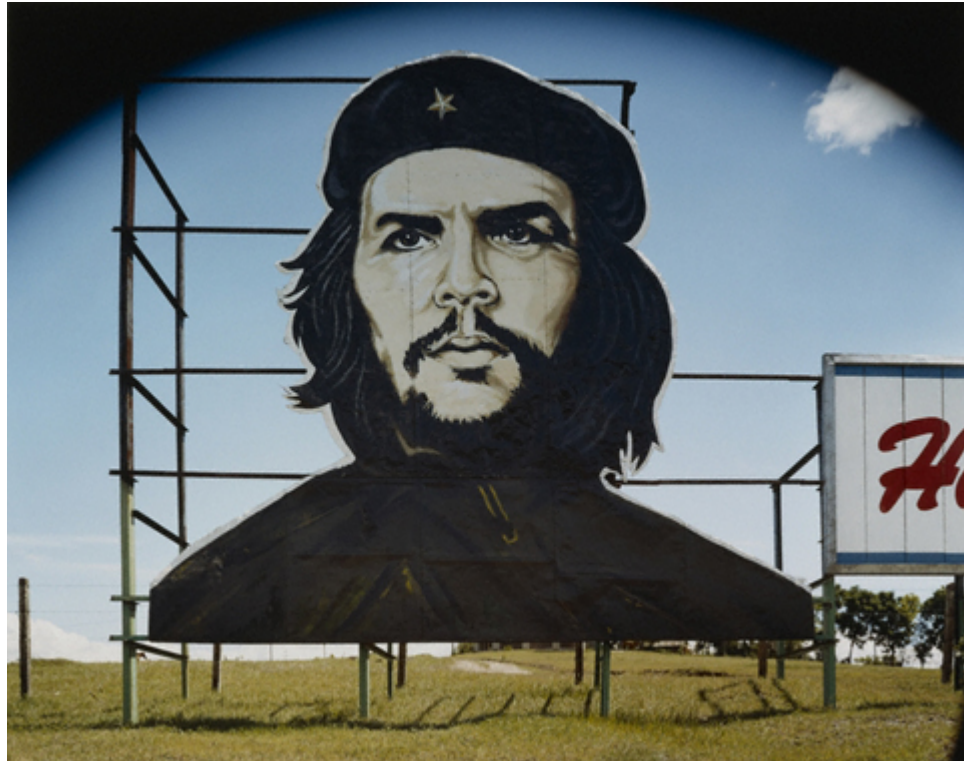
Hombre Nueva, Las Tunas, photo by Virginia Beahan, 2004.

roadways and beaches and the countryside; she photographed many highway propaganda billboards as well as a haunting landscape of the beach of the ill-fated Bay of Pigs invasion.