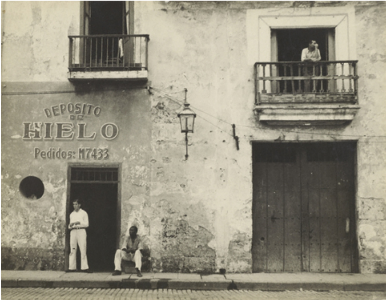
Old Havana Housefronts, 1933.

Dilemma, 2006