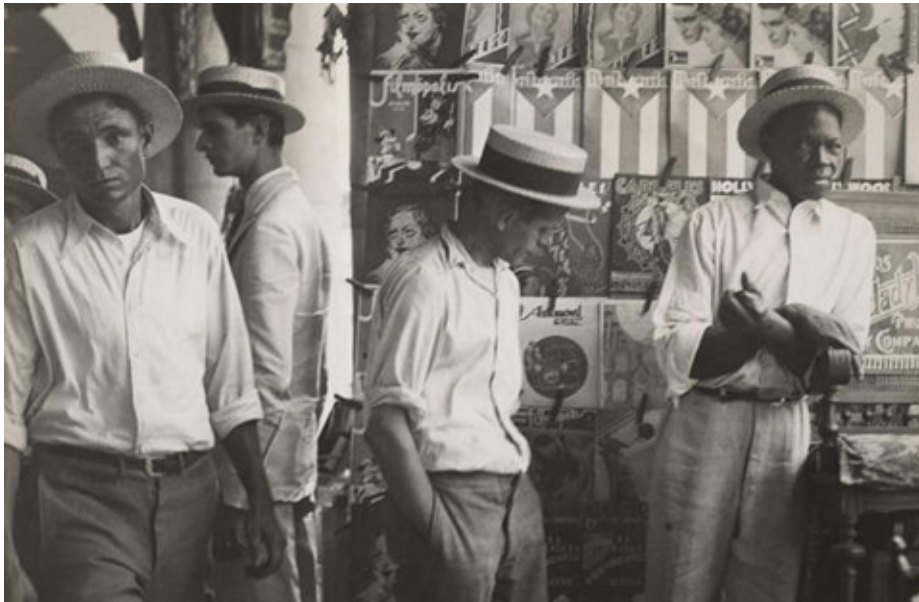
People in Downtown Havana, Or this lone snoozer amid a rank of chairs in a park.

such as this almost Cubist, fractured view of men and hats,