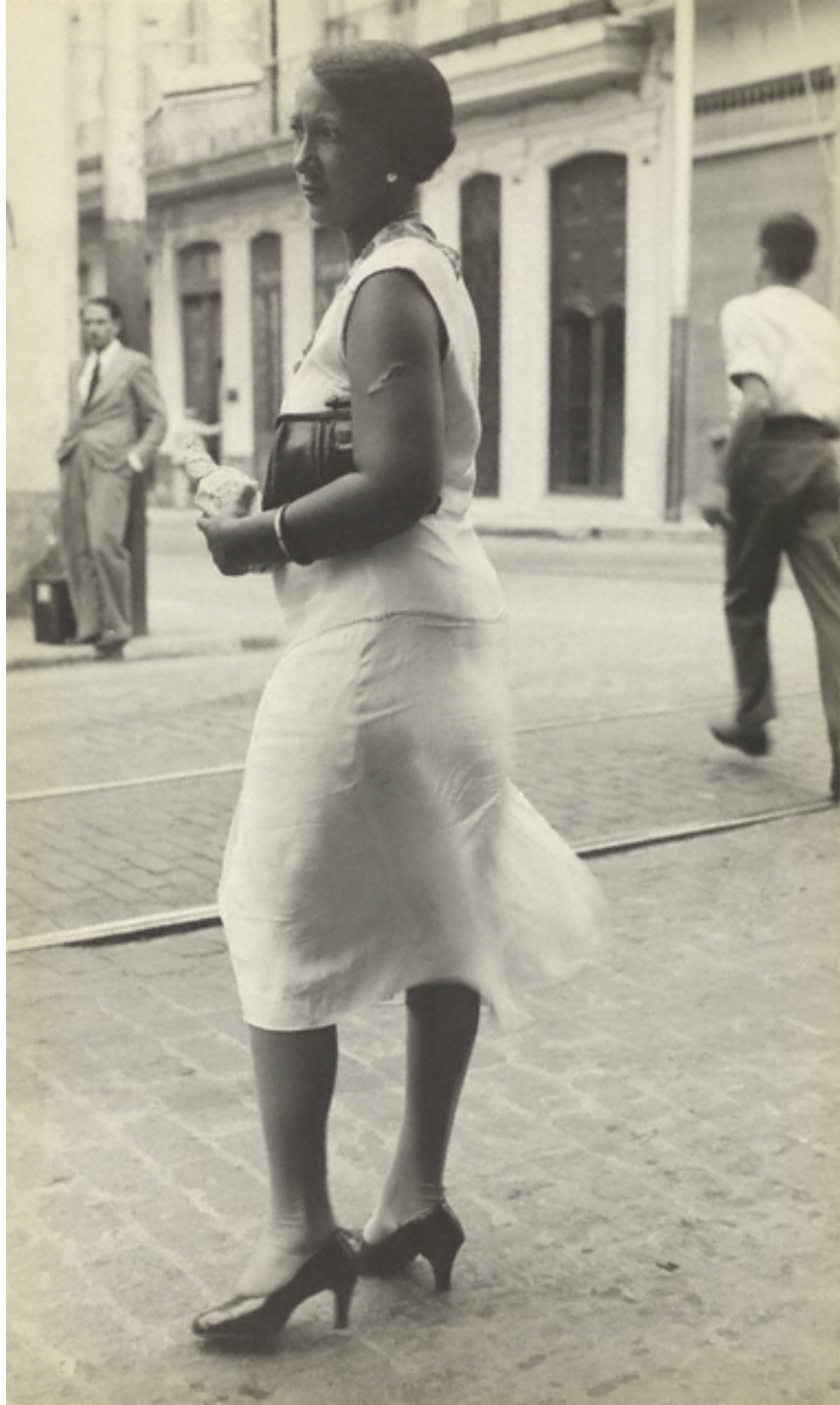
Woman on the Street, photo by Walker Evans, 1933.