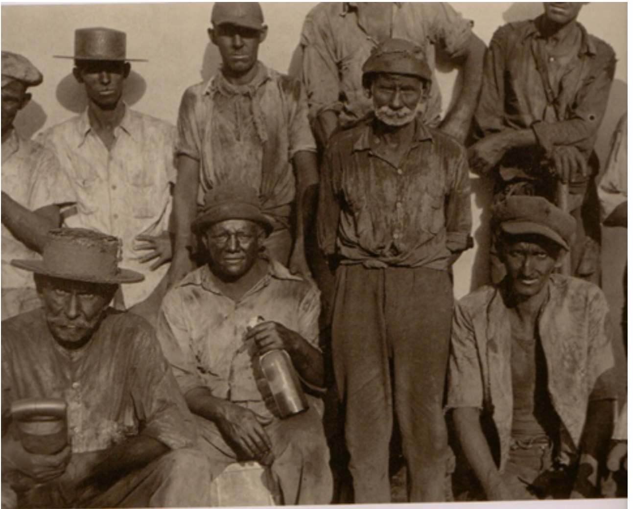
Coal Dockworkers

The anonymous flow of Cubans going about their everyday rounds or posing for Evans' lens already hints at the empathic vision he will demonstrate a few years later in his work in the agrarian South.